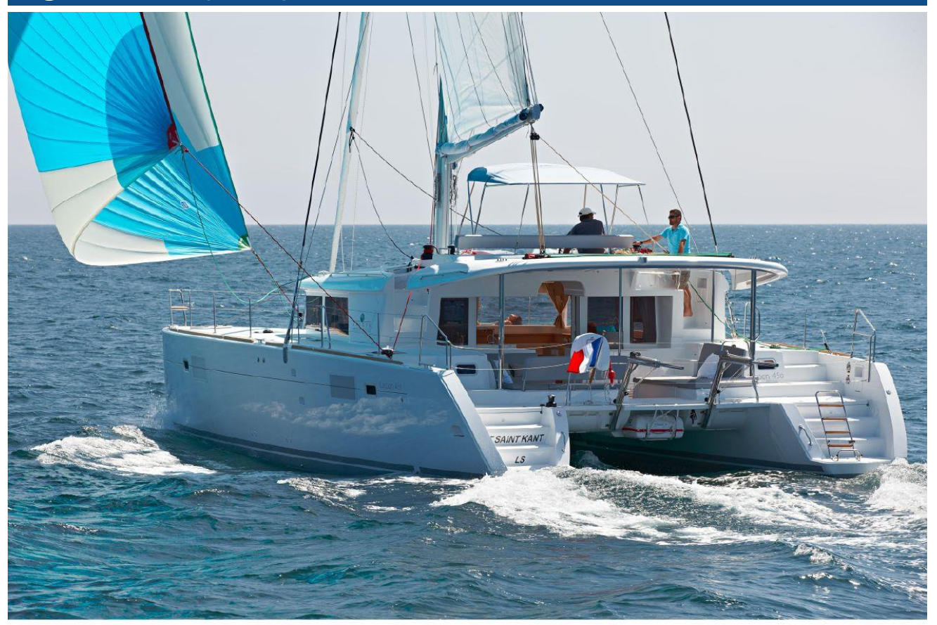
Lagoon 450